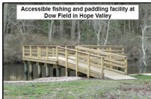
The Dow Athletic Field complex in Hope

Keeping the watershed healthy and accessible for all has been a consistent mission for WPWA. Now that your rivers are Wild & Scenic, WPWA plans to up its game by improving even more existing access areas and creating new ones. Sadly, many streamside access points allow stormwater to sweep gravel and road pollution directly into your rivers. Some also aren't designed or maintained to ensure that young and old folks alike can enjoy a safe interaction with the rivers. Thankfully, that is changing.