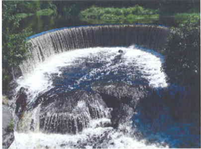
View of Upper Shannock Horseshoe Falls Dam looking upstream