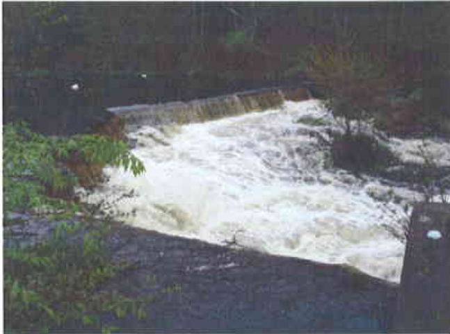
View of Lower Shannock Falls Dam from the right bank