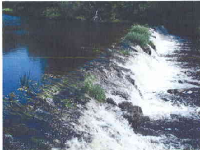
View of Kenyon Mill Dam from the right bank