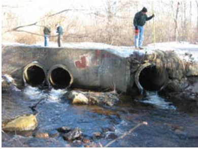
TU volunteers measure culverts on Wood

cause the streambed to drop below the culvert, so that there is a gap between the bottom of the culvert and the stream bed. Even a gap of only a few inches can present a barrier to brook trout trying to migrate upstream. Another common problem is the blocking of culverts by sediment or debris.