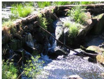
Lower Shannock Falls during low water conditions.

ing American shad, river herring, sea-run brown trout and American eel -- important fishery resources that once flourished in the Pawcatuck River watershed, but now are declining regionally due to habitat loss and degradation, over-fishing, and other factors.