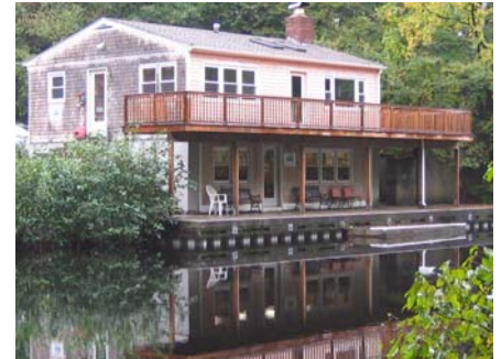
The main office at WPWA's Wood River campus.

Opinions expressed in Watershed are not necessarily those of WPWA, its Board of Trustees, or staff.