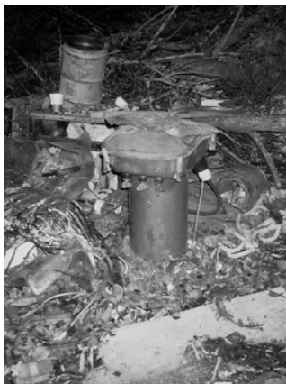
Assorted wastes, some hazardous, comprise 9000 cubic yards of the Bowley site