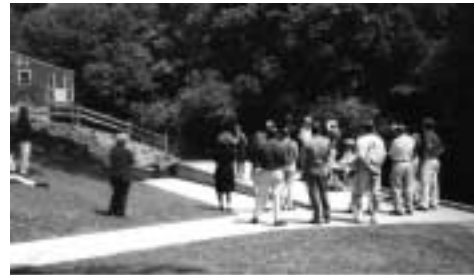
Federal and state officials, project partners, and the press gather for a formal dedication at Barberville.

more inclusive recreational opportunities available throughout the state, in partnership with DEM and the US Fish and Wildlife Service."