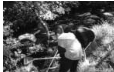
Fourth graders from Kent Heights School in East Providence explore aquatic insect habitat in Browning Mill Pond

Let's not forget the younger kids. Elementary school students from various RI districts participated in educational programs hosted by WPWA. Some focused on groundwater resources, some on habitat, and some on stream monitoring. Educational content aside, the opportunity to experience the rivers and habitat first-hand is what hopefully will result in a lifetime of appreciation for our watershed resources.