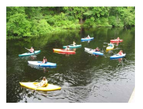
Students practice their newly acquired skills before they make their way up the river.

On many levels this program was very successful. Most of the students never before had a chance to experience the recreational opportunities of a vibrant river. Many of those who started off fearful were able to paddle back to the dock tired but triumphant. Through this program WPWA was also able to teach the students, their teachers and parents some key facts about the Wood River and its importance to everyone in RI. This program was made entirely possible through the REI Grant and their continued support of recreational and educational organizations such as WPWA.