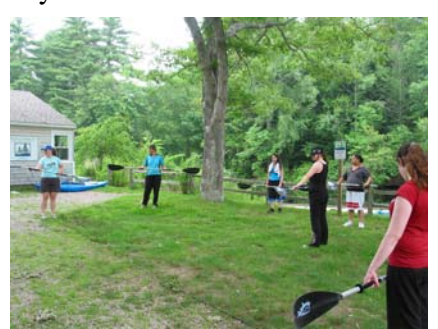
Students are taught basic paddling skills outside the WPWA education center before taking to the river.

the field trips were teachers, parent see a nice variety of wildlife and chaperones, and regular WPWA vol- wildflowers. Osprey, great blue her-This spring, thanks to a $5,000 unteers who helped supervise stu- ons, cedar wax wings, tree swallows, grant from REI, WPWA was able to dents on the kayaking field trips. It belted kingfishers, red-winged black offer the chance to learn how to was not very difficult to recruit birds, and many other birds treated kayak to almost 100 students, includ- enough volunteers for this program. paddlers to areal displays over the ing underserved and special needs The prospect of kayaking on the river. Eastern painted turtles seeking populations from around the state. Wood River was a big draw for any hint of sun could be seen on