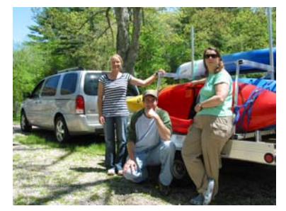
Staff with our new van, trailer and kayaks.

WPWA would like to thank CMS for their generous grant. We would also like to thank URE Outfitters who continue to support WPWA and the community. WPWA worked with URE to obtain everything needed at a special discount to keep the purchase within budget.