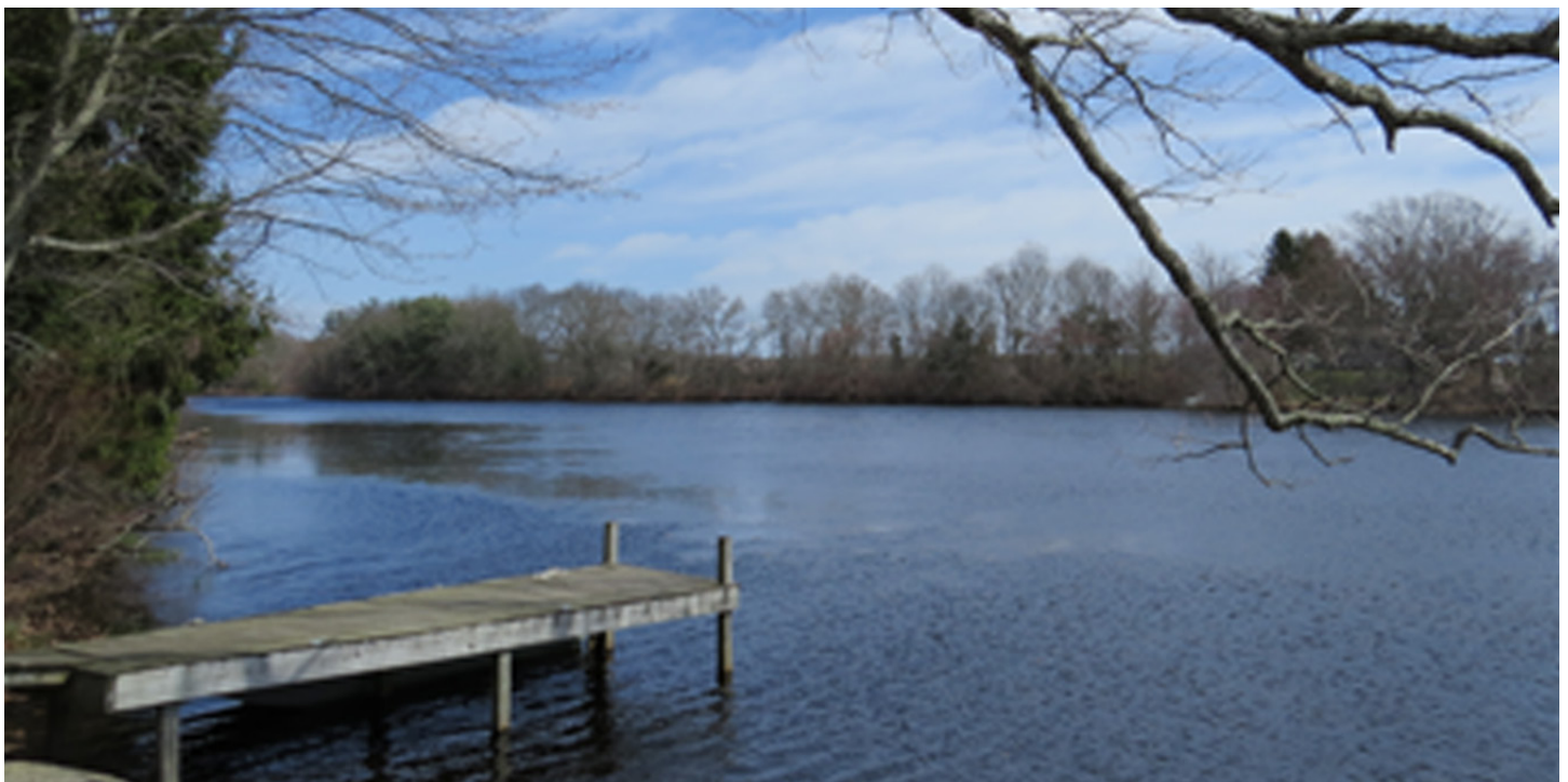
Queen River/Usquapaugh Pond