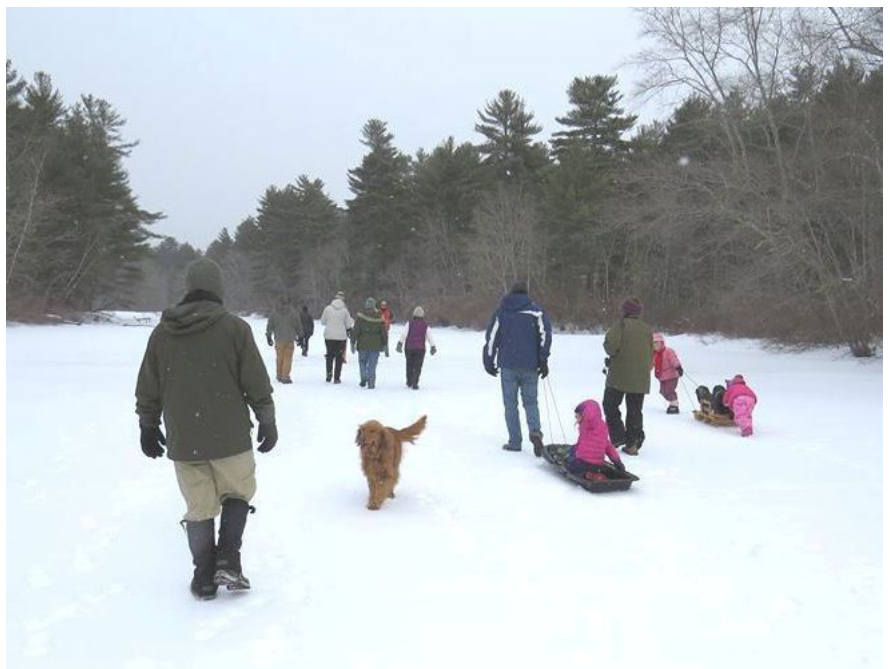
Wood River Ice Walk, Feb. 7, 2015