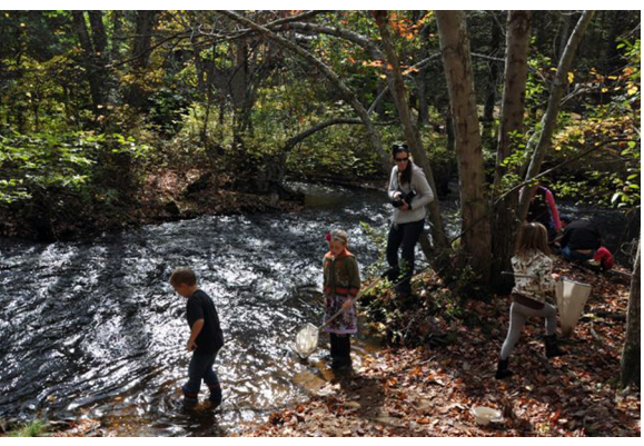
Field Trip for Second graders from Compass School at WPWA Campus