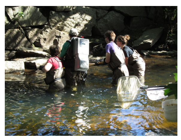
Fish smapling in the Woonosquatucket River