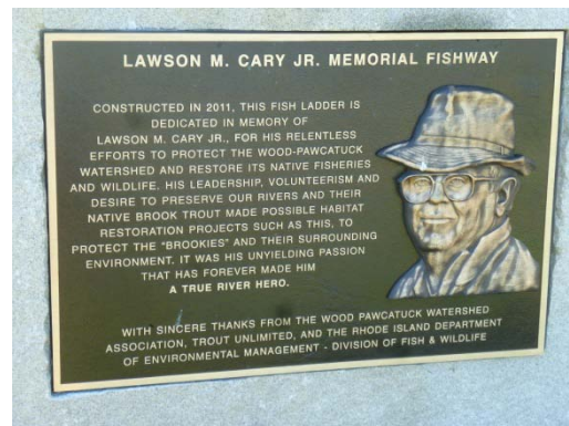
Lawson M. Cary Jr. Memorial Plaque at Horseshoe Dam