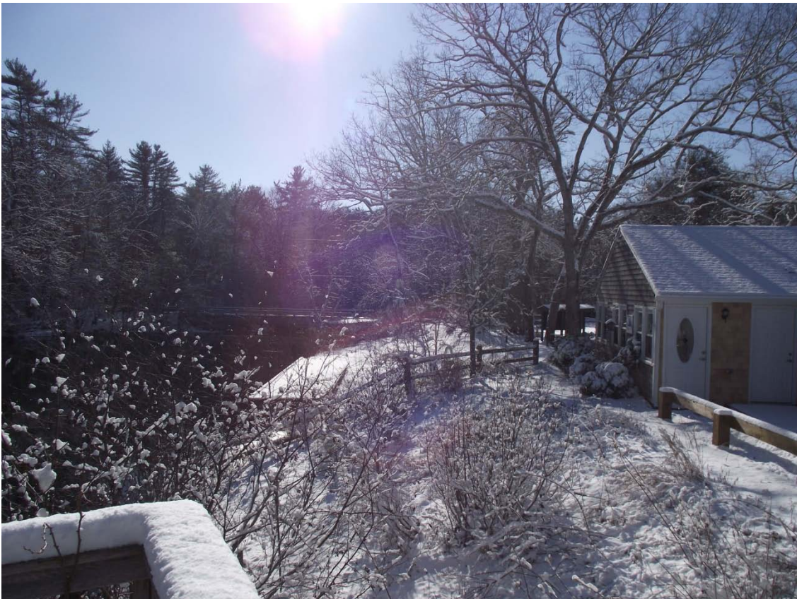
WPWA Campus in Winter